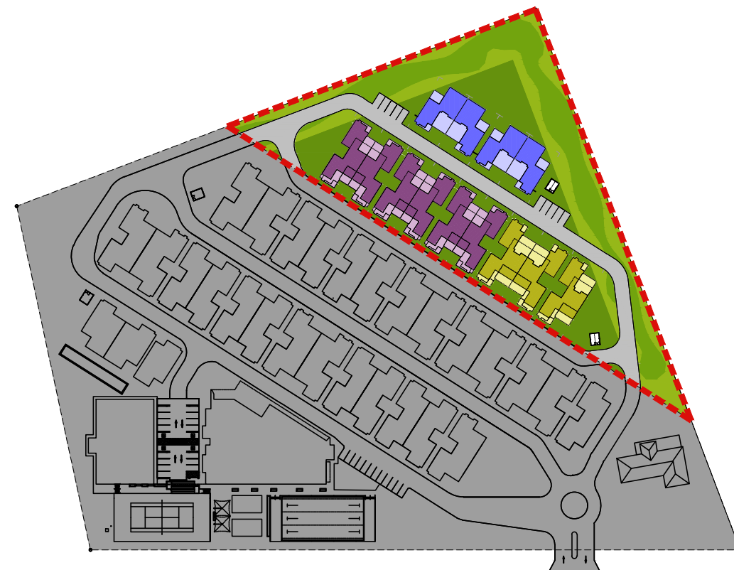
STAGE 4 SCALE 1 : 1000 @ A1 SCALE 1 : 2000 @ A3