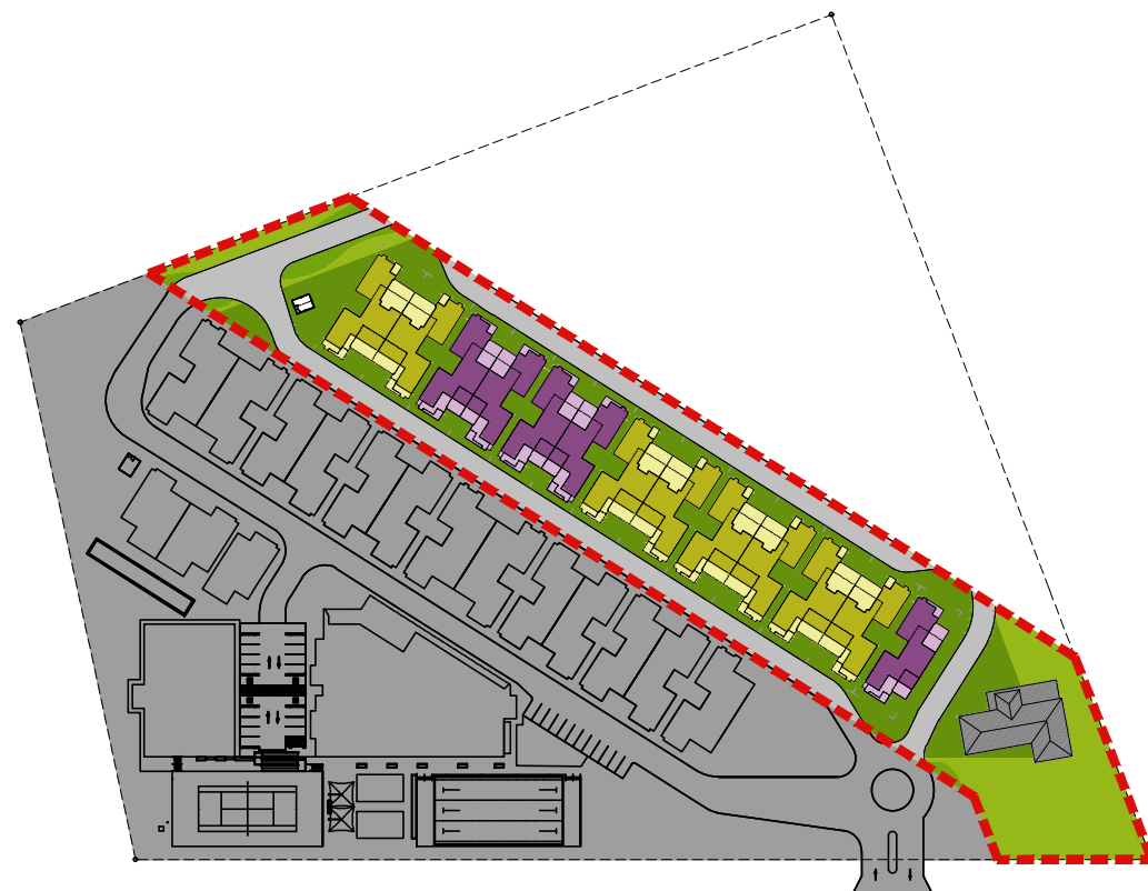
STAGE 3 SCALE 1 : 1000 @ A1 SCALE 1 : 2000 @ A3